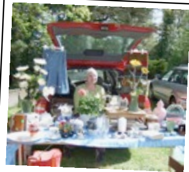
Car Boot Sale

Think carefully about your target and the scale of an event you can manageably organise.